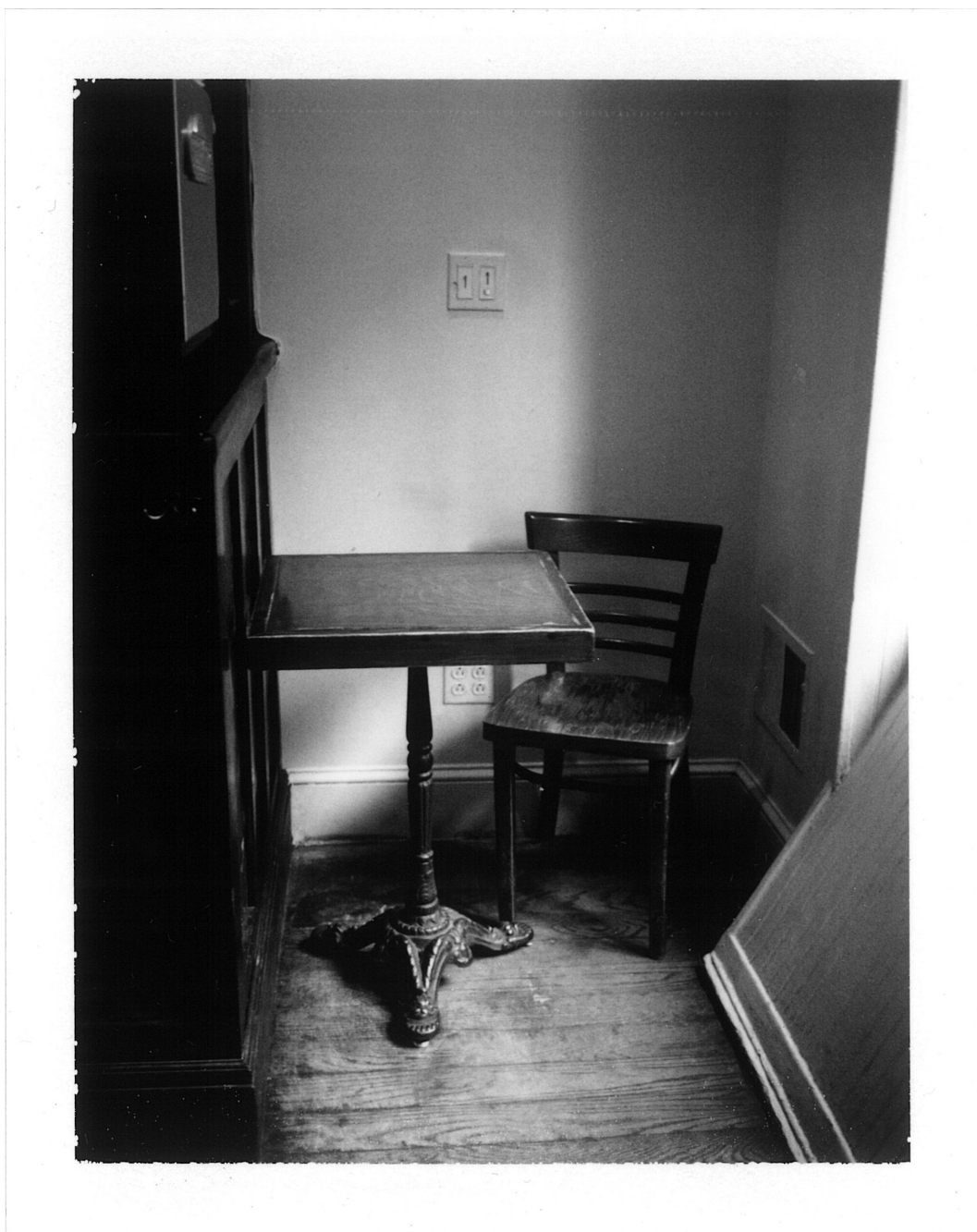
Café 'Ino, Bedford Street, 2013, Gelatin silver print, 10 x 8 in (25.4 x 20.3 cm)